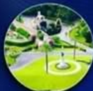
FONTANA DEL TRITONE